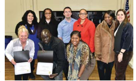
Almost Home Grads Graduates and coaches of the Clarifi Credit Boot Camp, the main component of our new Almost Home program.

Habitat Bucks successfully completed its pilot program, Almost Home, to keep prospective applicants engaged and better prepare them for homeownership. In February, nine families graduated from the keystone activity, Clarifi's Credit Boot Camp. Together, the participants saved over $10,000 and paid off over $2,000 of debt. During this time, one participant learned that she was selected to be our next homebuyer family!