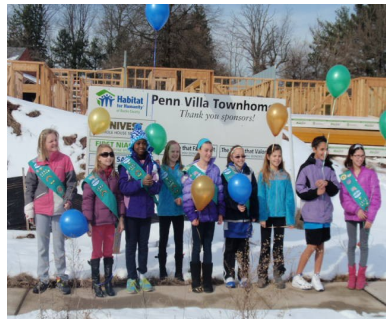
Top to bottom - Habitat Bucks Women Builders, Habitat Bucks Board of Directors, and a local Girl Scout Troup.

Our motto for this anniversary year is "Building on 25 Years of Strength". Our strength comes from you in the community who sacrifice your time and treasure. Last year, over 1,500 volunteers pitched-in, and individuals, foundations and corporate donors contributed over $600,000 to support the Habitat mission.