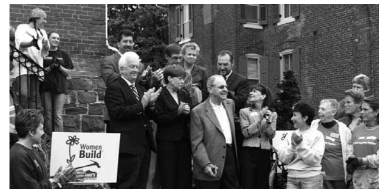
The ribbon cutting on May 6 signifying the groundbreaking of Habitat for Humanity of Bucks County's newest homebuilding site, The Stitchery, in Perkasio.

Habitat for Humanity of Bucks County's latest and greatest homebuilding program is located at 815 West Chestnut Street in Perkasio Borough and represents our first ever "adaptive reuse" project. Groundbreaking took place in May during National Women Build Week, when crews of women volunteers raised their hammers as part of the Women Build program (pictured). Homeowner families are expected to move in early 2010.